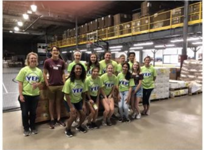
Volunteering at the Midwest Food Bank