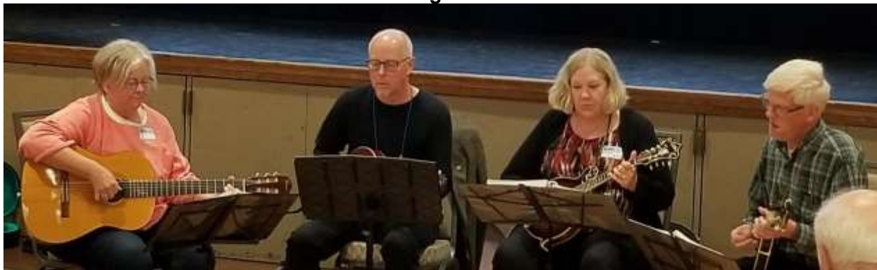
Quartet from the B/N based Orpheus Mandolin Orchestra.