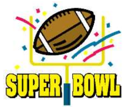
"Super Bowl Ready!"