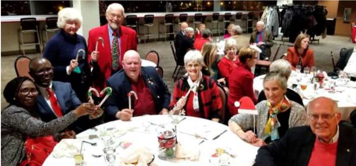
The Winning Trivia Team – “Winter Wishes”