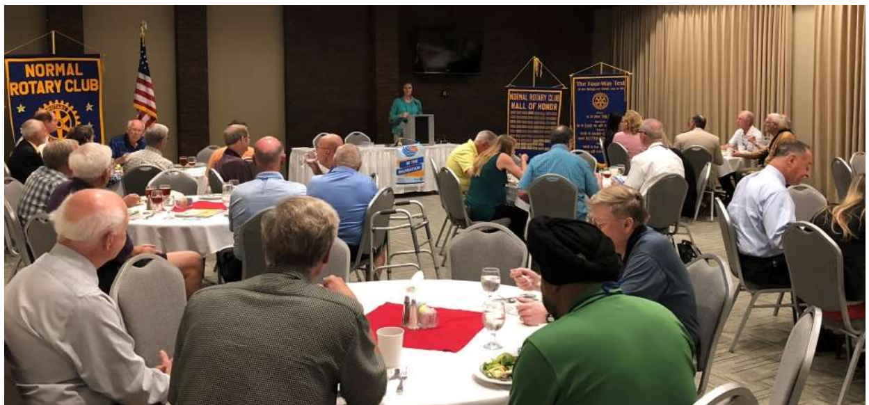
A different room & a different view – BSC Prairie Room South

https://www.signupgenius.com/go/30e0944a8ab2fa4f49-oktoberfest