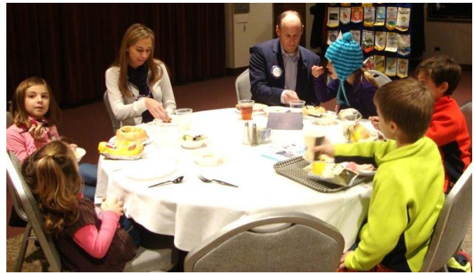
Wow! A table of 5 future Rotarians!