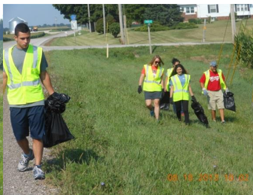
The ubiquitous Friends Forever contingent was on hand to help keep McLean County highways tidy.