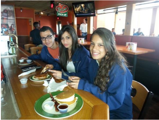
The Friends Forever contingent worked hard serving pancakes at Applebee's, but they also took time to sample some awesome breakfast cuisine.